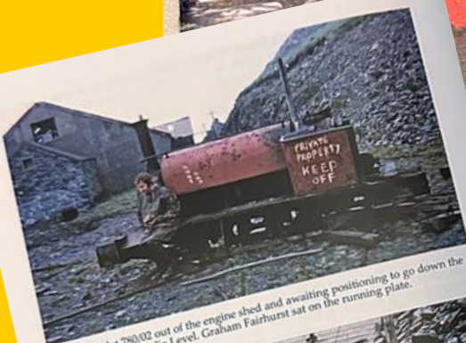
Alice, Hunslet 780/02 out of the engine shed and awaiting positioning to go down the first incline on Australia Level. Graham Fairhurst sat on the running plate.