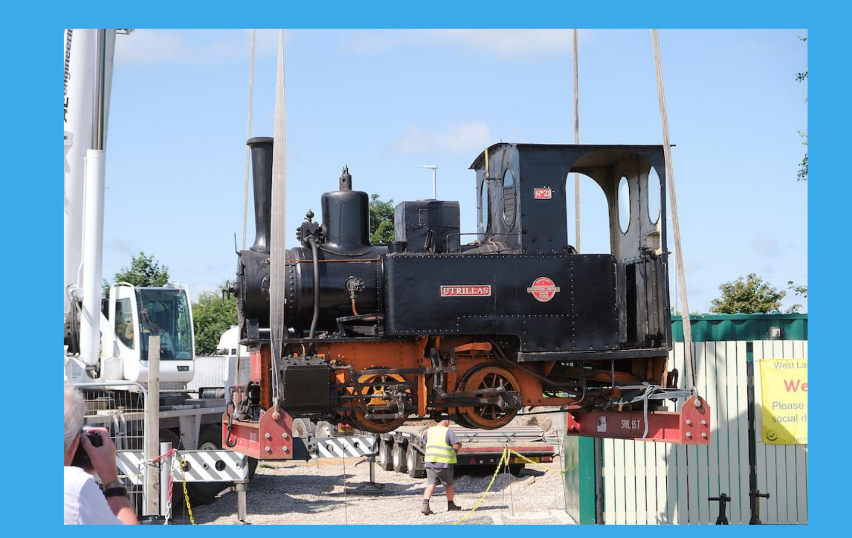
UTRILLAS ON THE MOVE!

One of our two Orenstein & Koppel locomotives has recently left us for pastures new at the Lancashire Mining Museum, Astley Green. The museum features Lancashire's last remaining winding house and headgear, but until now lacked a steam locomotive to help tell the story of the colliery. Utrillas has served us well for over 30 years, and will no doubt continue to give good service at her new home.