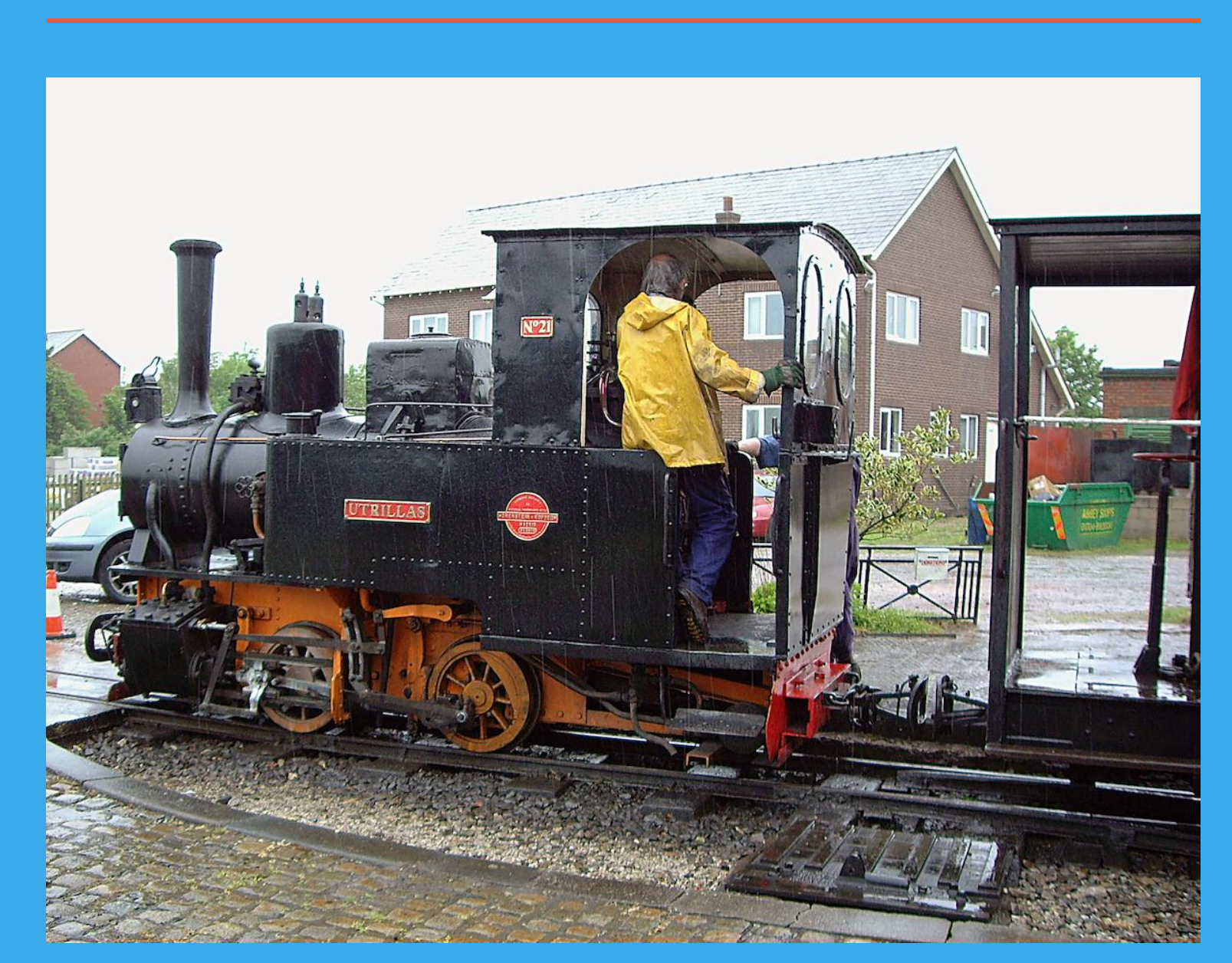
And finally, a shot of Utrillas working on a rather damp May afternoon in 2007.

Then Marc Goldring visited us to film a unique series of videos showing a locomotive's eye view of the Railway. The end results are <a href="here">here</a> - well worth a look!