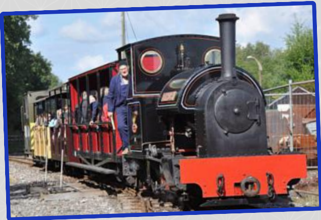
Apedale Valley Light Railway

And finally, it's official: Three small railways are better together!