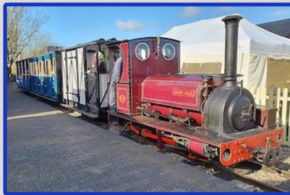
West Lancashire Light Railway

Apedale, Amerton and West Lancs are 2'0" gauge railways with a lot in common. All are entirely volunteer managed and operated, all rely heavily on steam traction, and all are underpinned by charitable organisations. Recognising the similarities in the organisations, the three have decided to forge closer ties. A memorandum of understanding has been agreed between the three. This will foster closer working, and the sharing of good practice and knowledge between the three organisations.