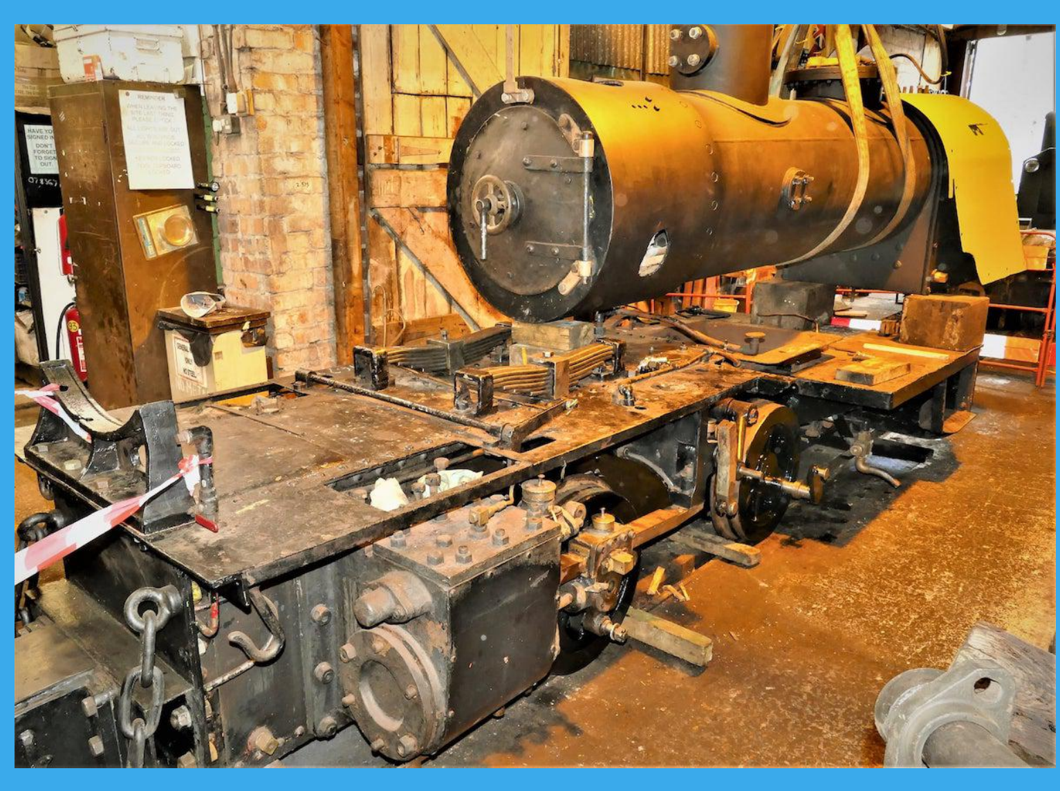
More progress with Montalban's refit, with the wheels re-installed and the boiler being lowered back onto the frames.