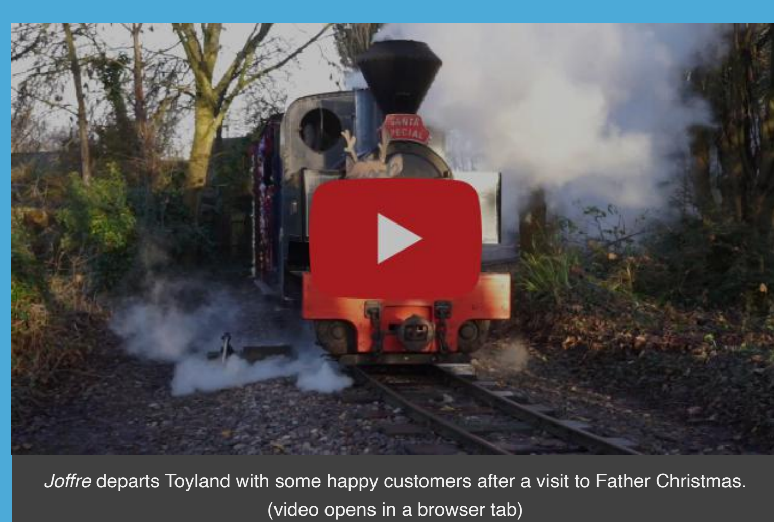
Joffre departs Toyland with some happy customers after a visit to Father Christmas. (video opens in a browser tab)