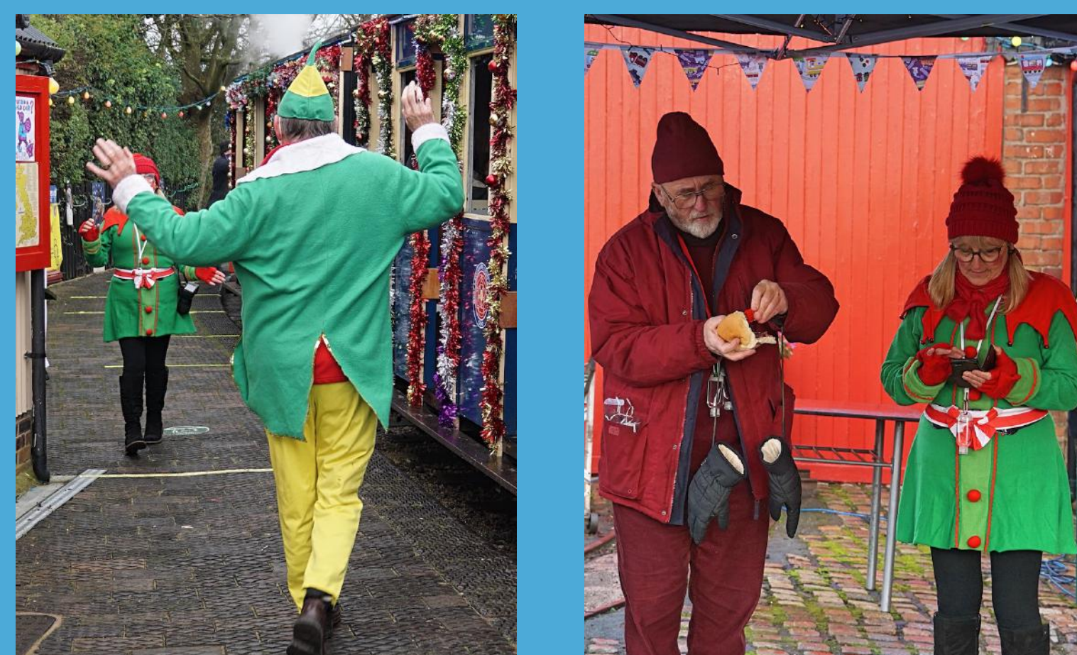
You just can't get the staff...