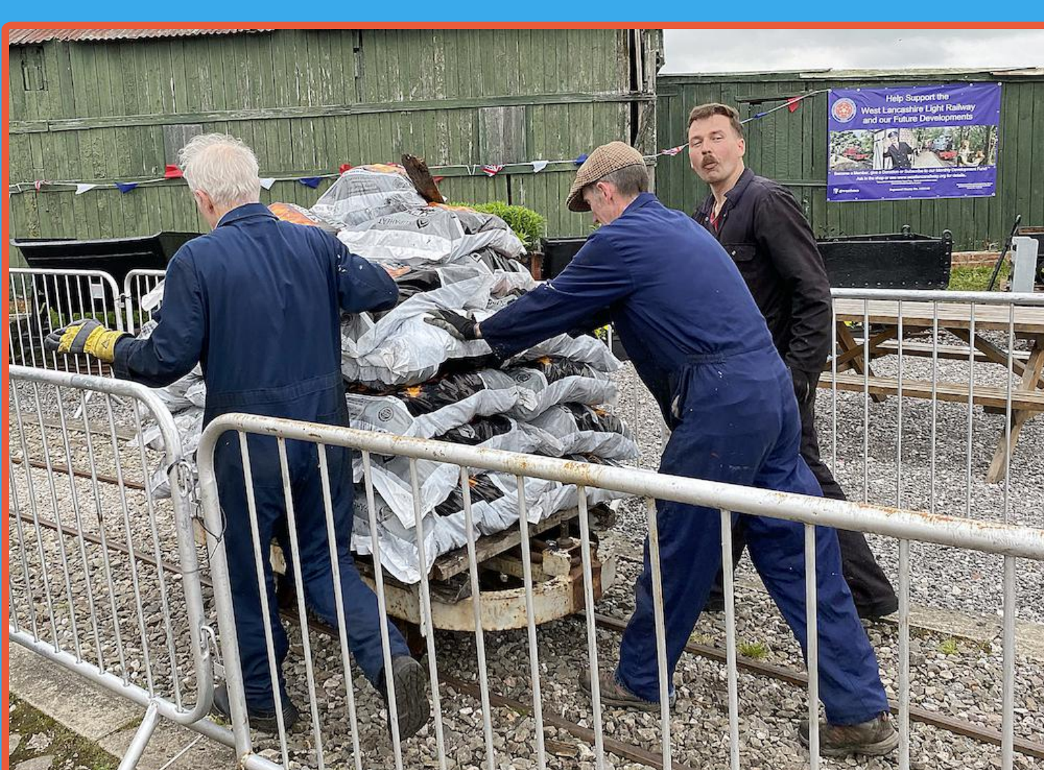
Absconding with some valuable, and increasingly rare, loot. Five tons of finest Welsh cobbles arrived by special delivery, and was rapidly propelled by equally special train to a place of safety. Where exactly is not for publication...