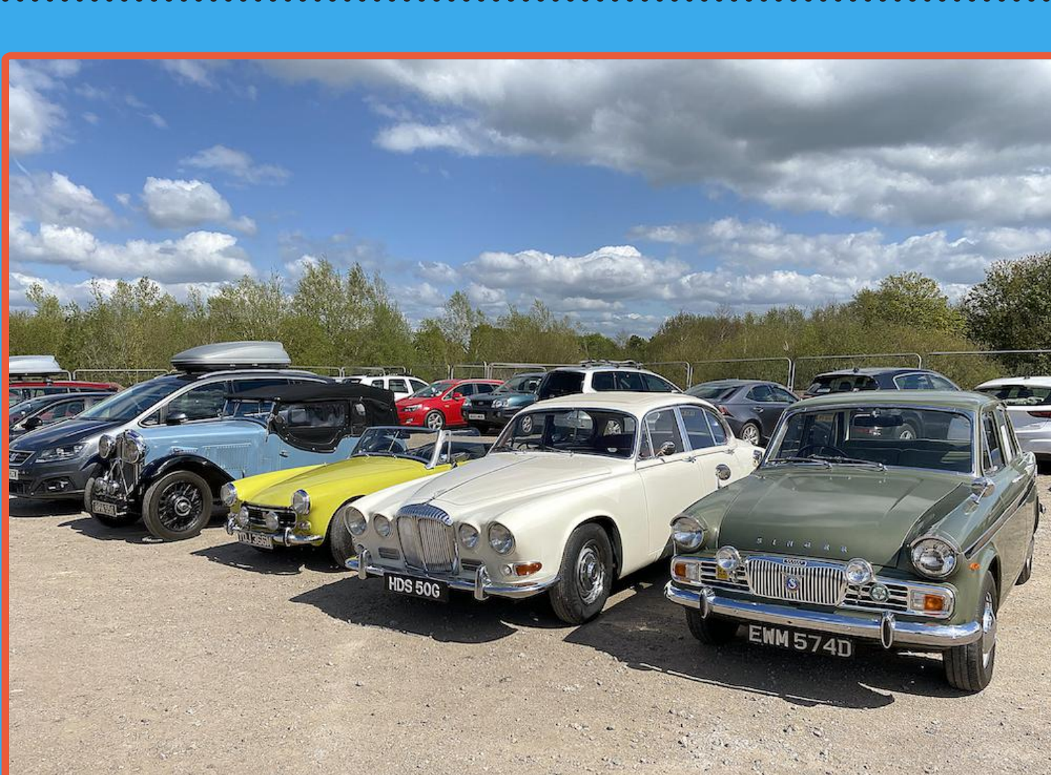
Not just heritage trains - a fine group of classic cars visits the Railway, courtesy of the Thursday Knights Vintage and Classic Car Club.