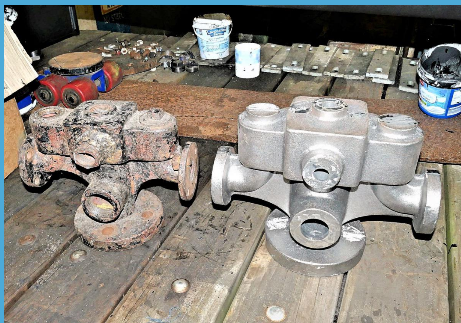
Spot the new one! Montalban has a brand new steam manifold, cast from wood patterns made by our own Alan Frodsham.