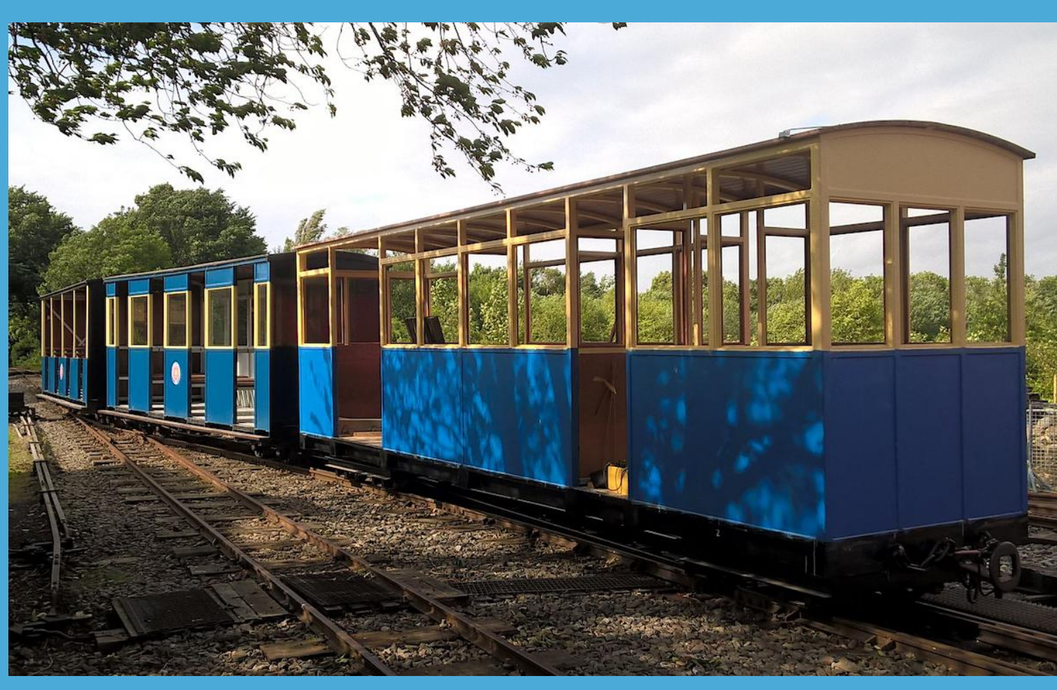
Our part-built access coach gets its first run out with our two existing coaches. Don't they look good together?