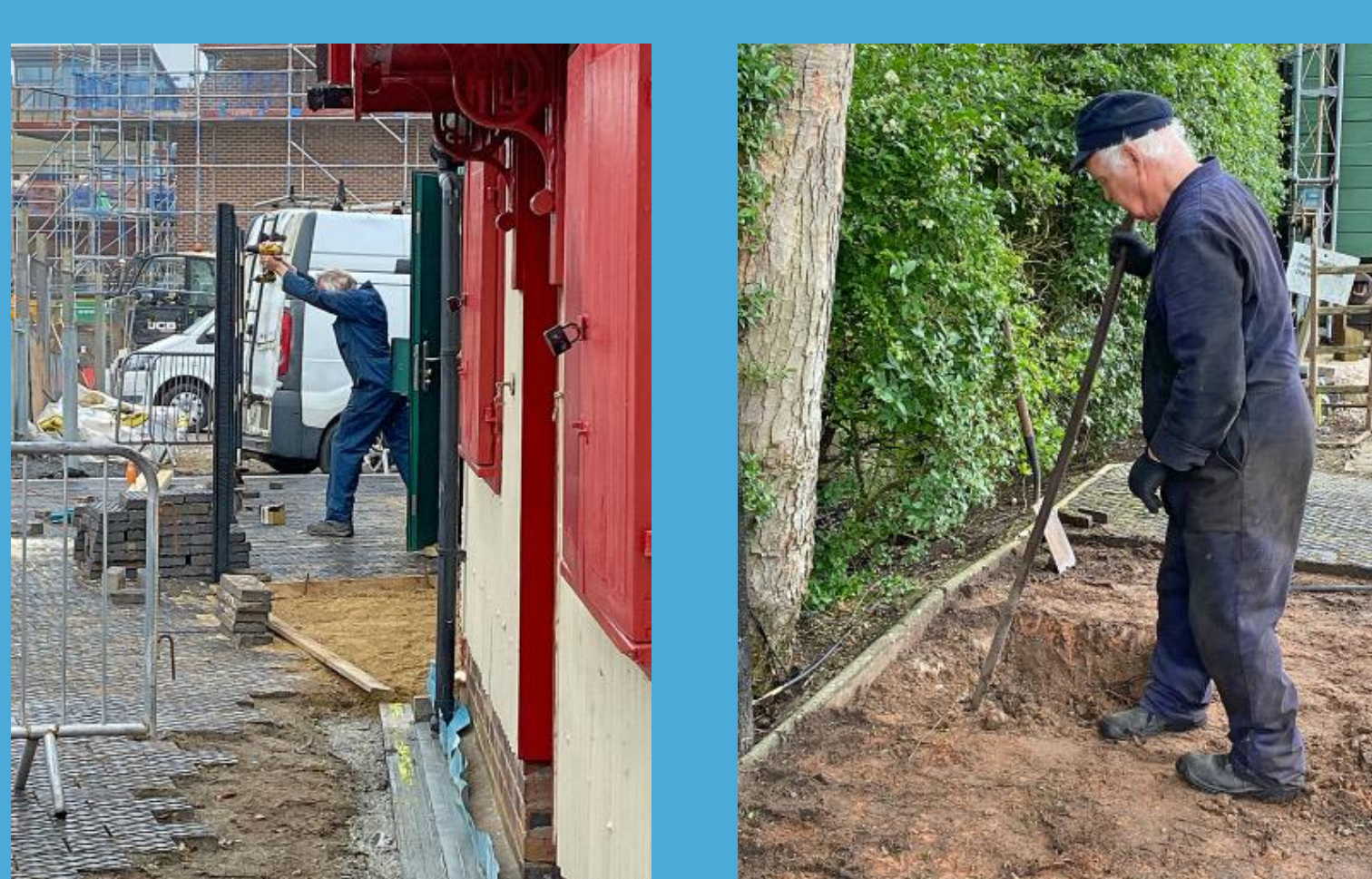
At one end of the platform the toilet screen gets its wood cladding, and at the other a troublesome tree root is excavated.