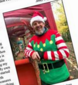
The editor as one of Santa's helpers

Submitting Material to Short Axle Short Axle is the journal of the WLLR Trust. The Editors welcome articles of WLLR interest. Please, ensure you have copyright for any material you submit. Electronic formats are preferred but handwritten / typed may be considered. Photographs can be submitted in JPEG or TIFF format. Any material may be edited as required. Copy should be sent to the Editor's email: shortaxle@westlancsrailway.org Deadline for next issue - 30 June 2023